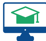
Operational and Risk Sound Practices