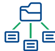
Define Potential Use Cases